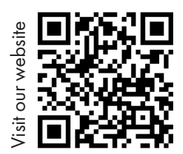
Visit our website

Follow us on Facebook, Instagram, and our website for up to date information.