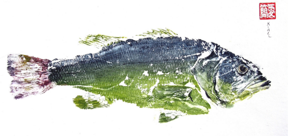
Gyotaku fish print by Jean Kigel

For details, visit: maineartgallerywiscasset.org/classes